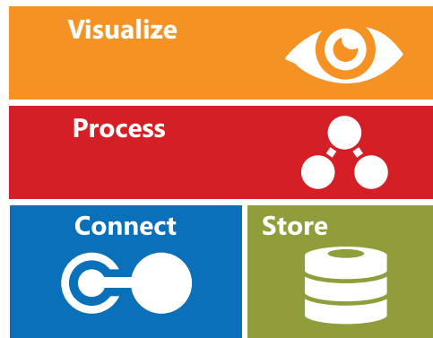
The APIS Industrial IT platform